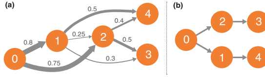
Fig. 1. Examples of (a) an infection network, and (b) infection tree. On the network, each directed edge weight represents the probability of the source node being responsible for introducing the disease on the target one. The infection tree is built by taking into account the paths with higher probability. (color online)

sources. The average of p_{ij} over all realizations will give us the resulting probability that the infection will propagate along the connection linking city i to city j . These averages are then used as the weight of the edge between the corresponding nodes on the network, as shown in Figure 1(a).